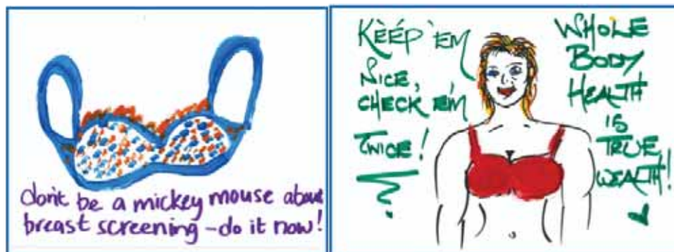
Figure Three and Four: messages to LBT women

In the year after Midsumma Carnival, BSV participated in a Lesbians and Breast Cancer Forum facilitated by Gay and Lesbian Health Victoria (see figure five). The Forum included presentations by a researcher on the rates of breast cancer in lesbians, stories from two lesbians with breast cancer and a presentation on this project by BSV.